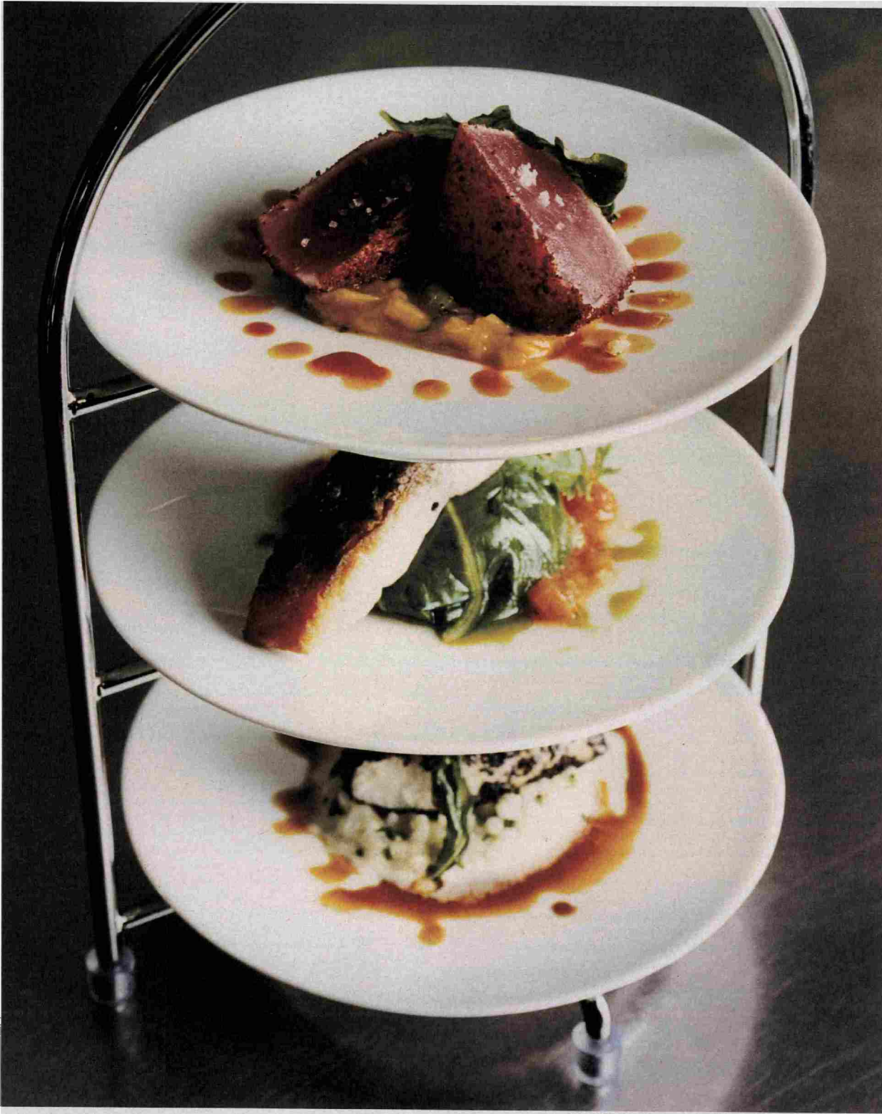
THE NEW YORK TIMES STYLE MAGAZINE | NOVEMBER 18, 2007 161