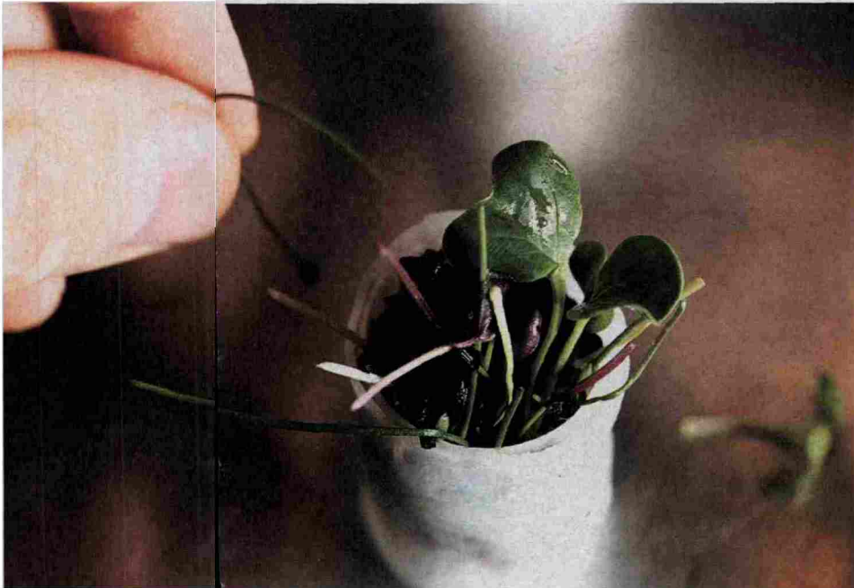
CREATIVE LICENSE Previous spread, left: cauliflower in chicken-feet geleé with green chive sorbet and caviar, at Restaurant 44 in Berlin. Right, three dishes at G-Munich, from top: tandoor-roasted tuna with mango-peperonata chutney; sea bass with chard, veal tail and Chartreuse; and rabbit with black trumpet mushrooms on pearl-barley risotto with herbs and Madeira jus.